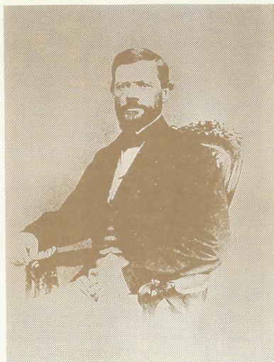
Charles Debrille Poston 1825-1902

Charles D. Poston was one of the first mineral entrepreneurs to explore the area of the Gadsden Purchase, when in 1853, he came in search of the Planchas de Plata , the legendary native silver deposit that created the first miner's rush during the late 1700s into what would become Arizona. Poston didn't find his bonanza, but his efforts in promoting, financing and developing the silver and copper mines of Southern Arizona in the Cerro Colorado and Santa Rita mining districts was the first sustained organized mining effort in Arizona and focused the attention of many of the financiers and investors of the day toward Arizona's resources. The principal result of Poston's efforts was the creation of a separate territory of Arizona from New Mexico territory for which he became known as the "father of Arizona."